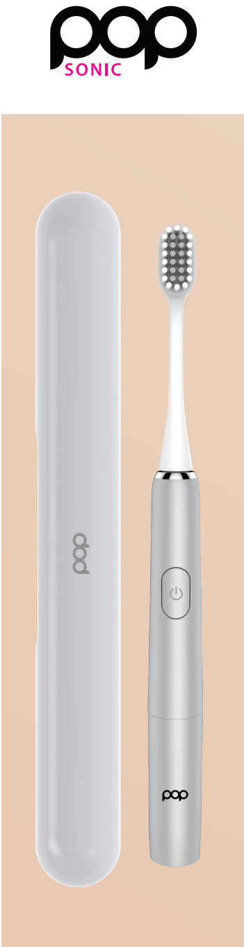
GOPLUS SONIC INSTRUCTION MANUAL